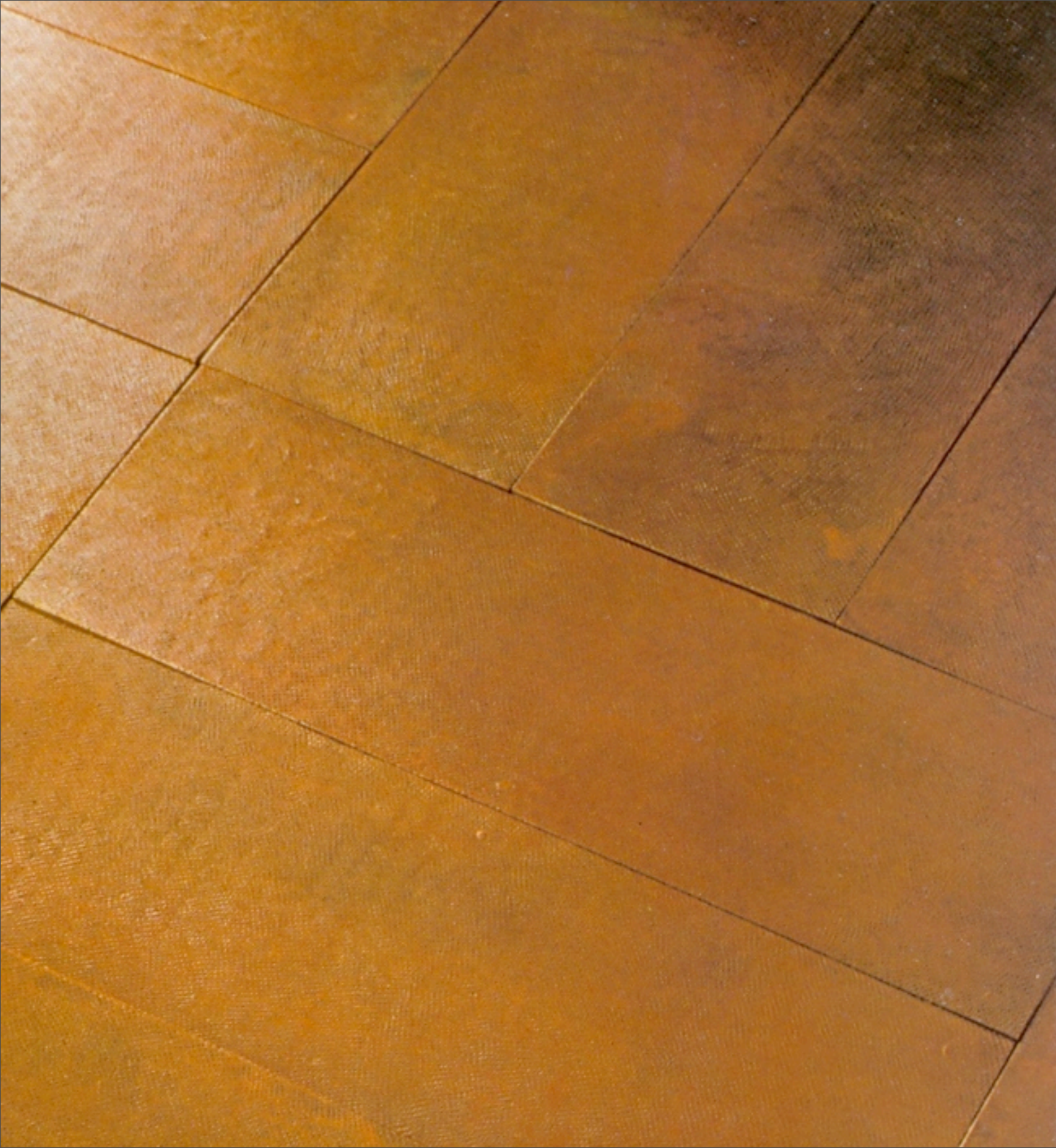
Hammered Copper Briquettes (300 x100mm)