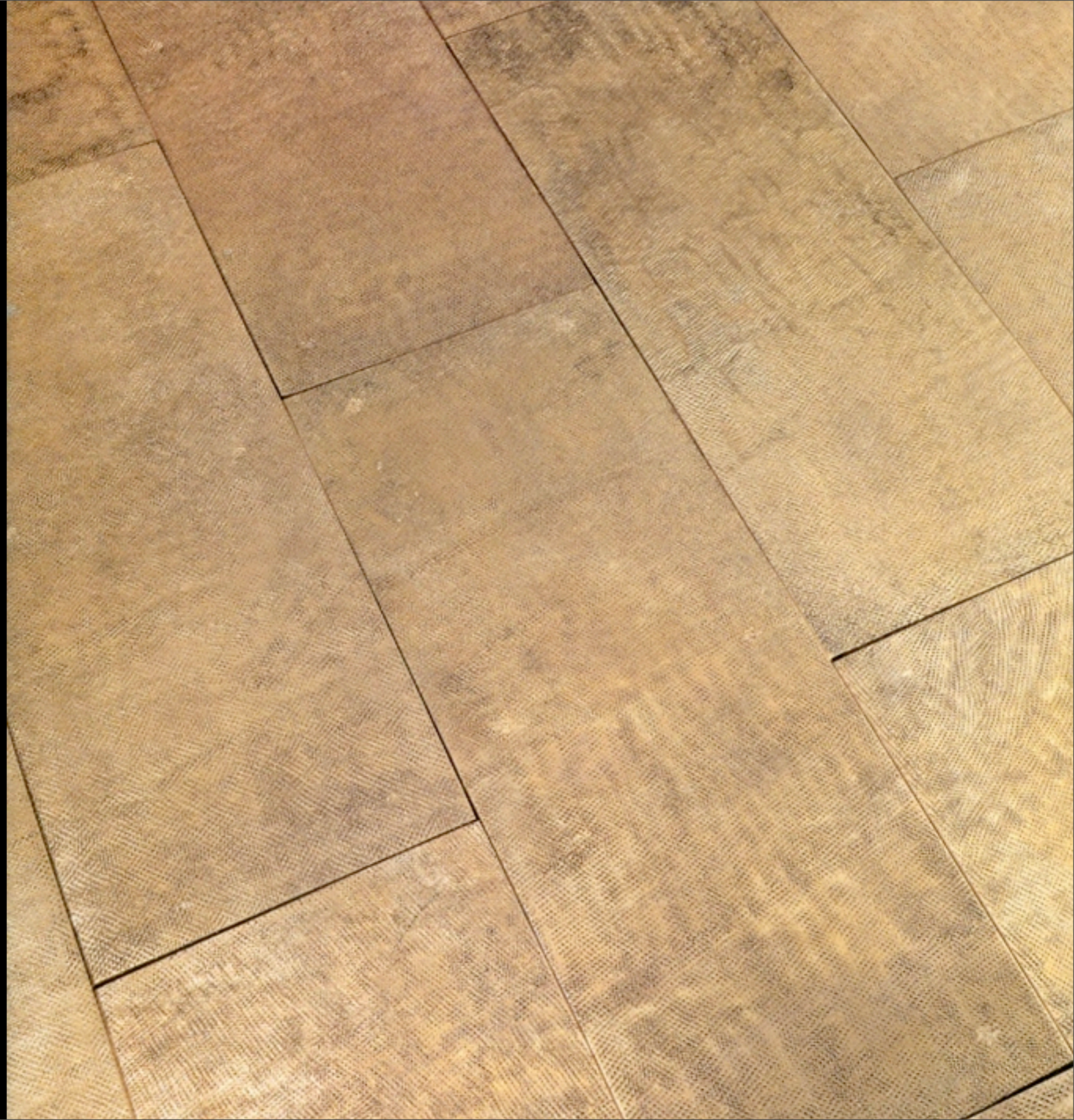
Hammered Brass Briquettes (300 x100mm)