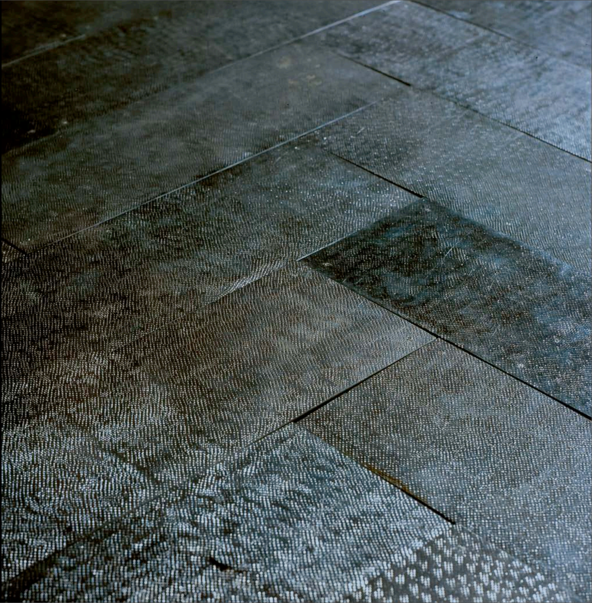
German Silver Briquettes (300 x100mm)